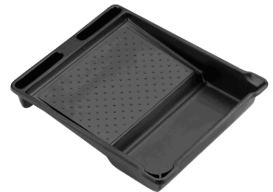
Paint Roller Tray